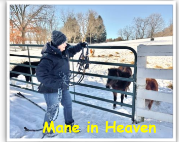
Mane in Heaven