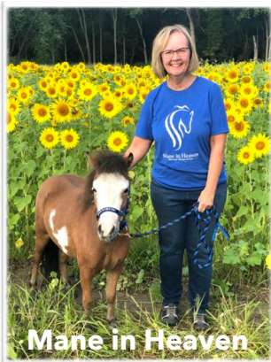
Mane in Heaven

2019 was another year filled with travels, fun, accomplishments, memories, and growth. We were able to visit with many friends and family at our house and theirs and follow our friends' and family's activities throughout the world.